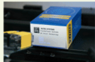
Serialized 2D Bar Code Lot & Expiration Date